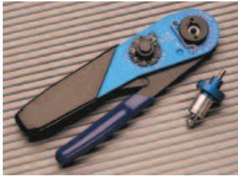
Plier No. 900 and Crimp Plier Locator