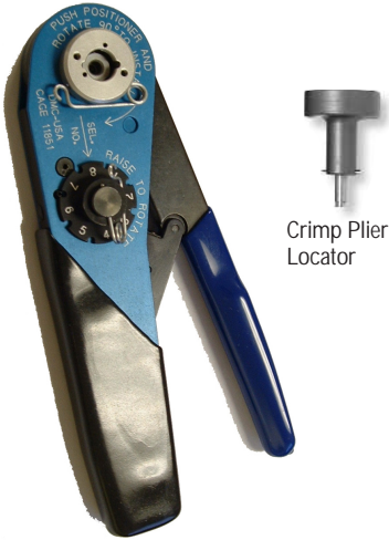
Crimp Plier Locator